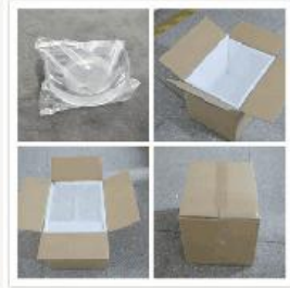
General Packaging: PE bag/ bubble bag + foam card + outer box