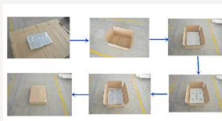
Safety Packaging: PE bag/ bubble bag + foam card + inner box + outer carton